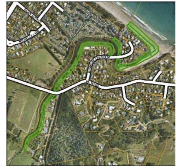
Wigmore Stream Reserve (Ko Tahuri-ki-te-Rangi) - Hahei