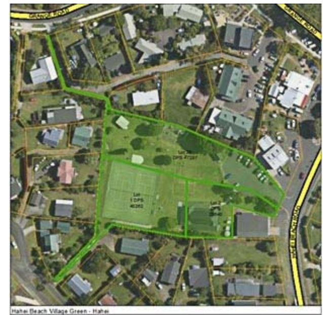
Hahei Beach Village Green - Hahei