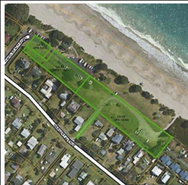
Hahei Beach Recreation Reserve - Hahei