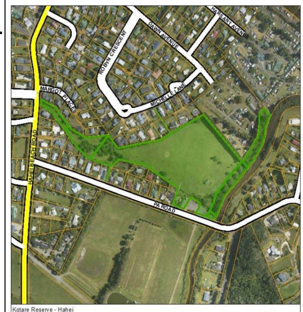
Kotare Reserve - Hahei