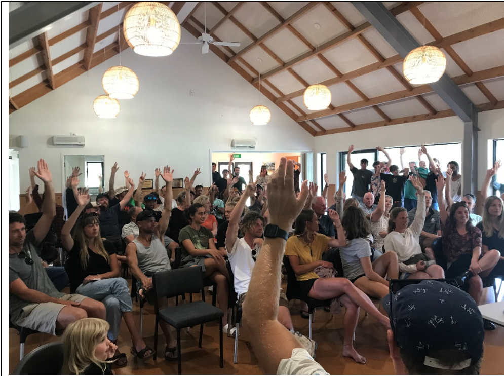
Vote – Showing most people support Half Pipe